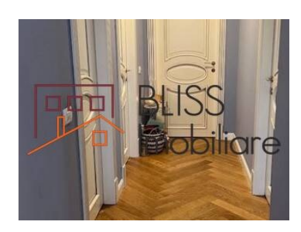
BLISS Imobiliare © 2025