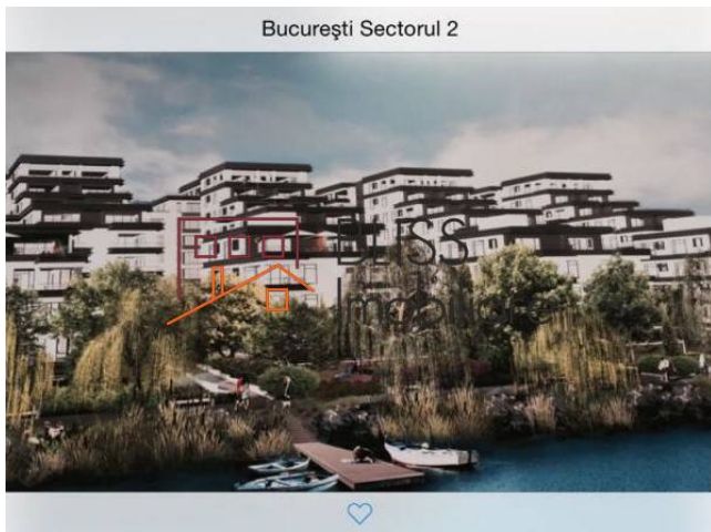
București Sectorul 2