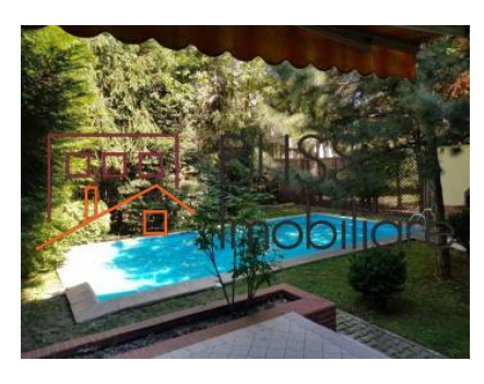
BLISS Imobiliare © 2024