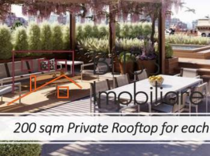
200 sqm Private Rooftop for each